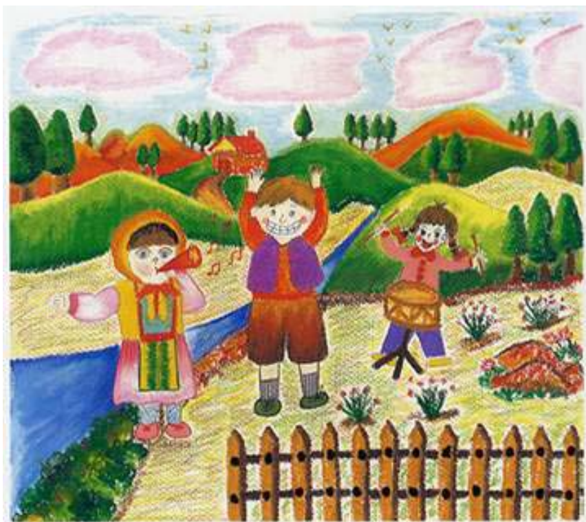
Drawing: Freeyaporn Asavapinyokit Sacred Heart Convent School, Bangkok, Thailand