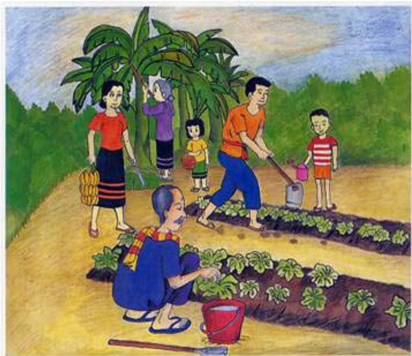
Drawing: Sasikarn Hantrikanon Sasta Cruz School, Bangkok, Thailand