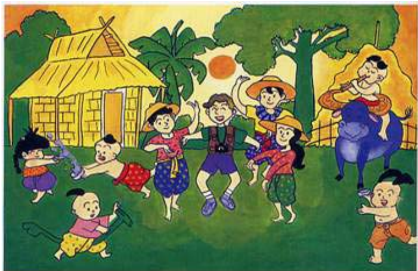
Drawing: Itthidej Boriboon Prachanad School, Samutprakarn Province, Thailand