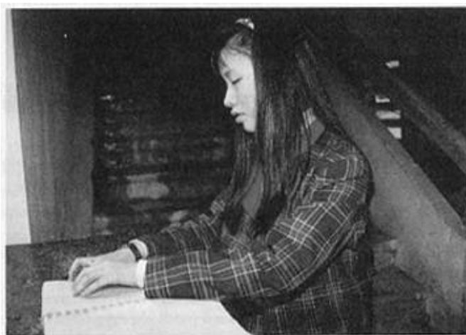
Person who is visually impaired has the right to education